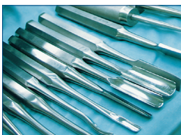
Medical and labor industries